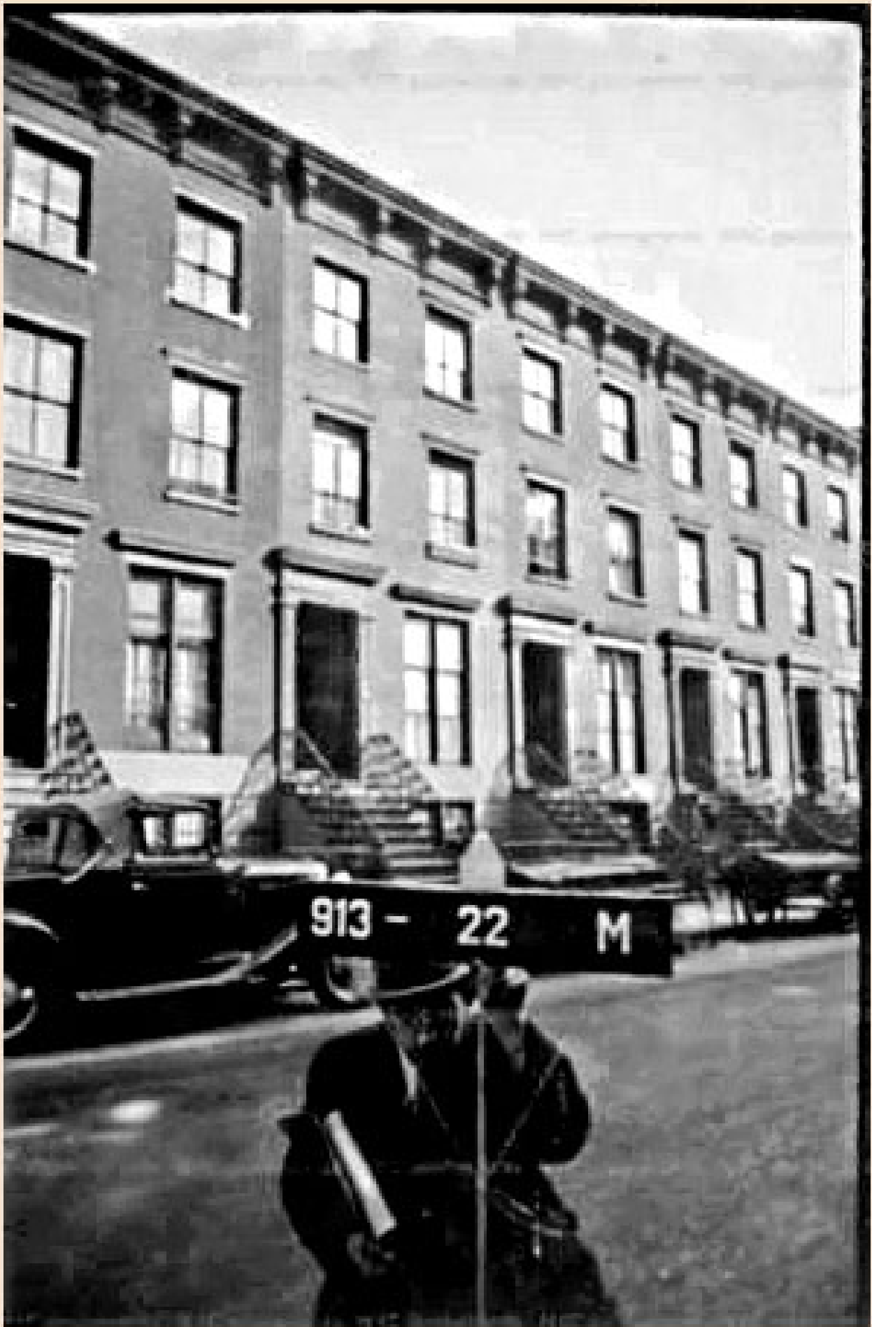
241-243 East 32nd Street 1940