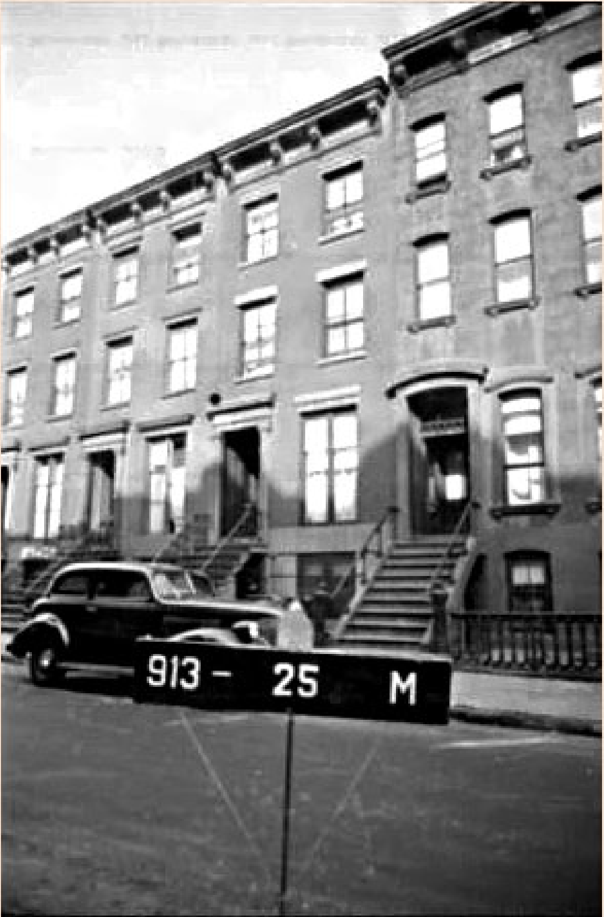
249 East 32nd Street 1940