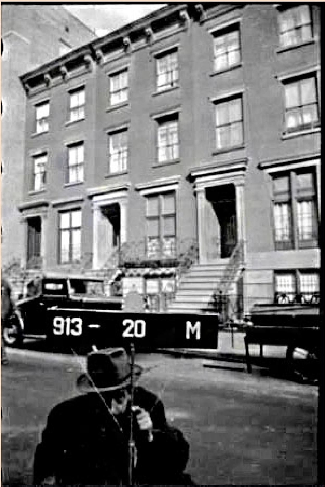
237-241 East 32nd Street 1940